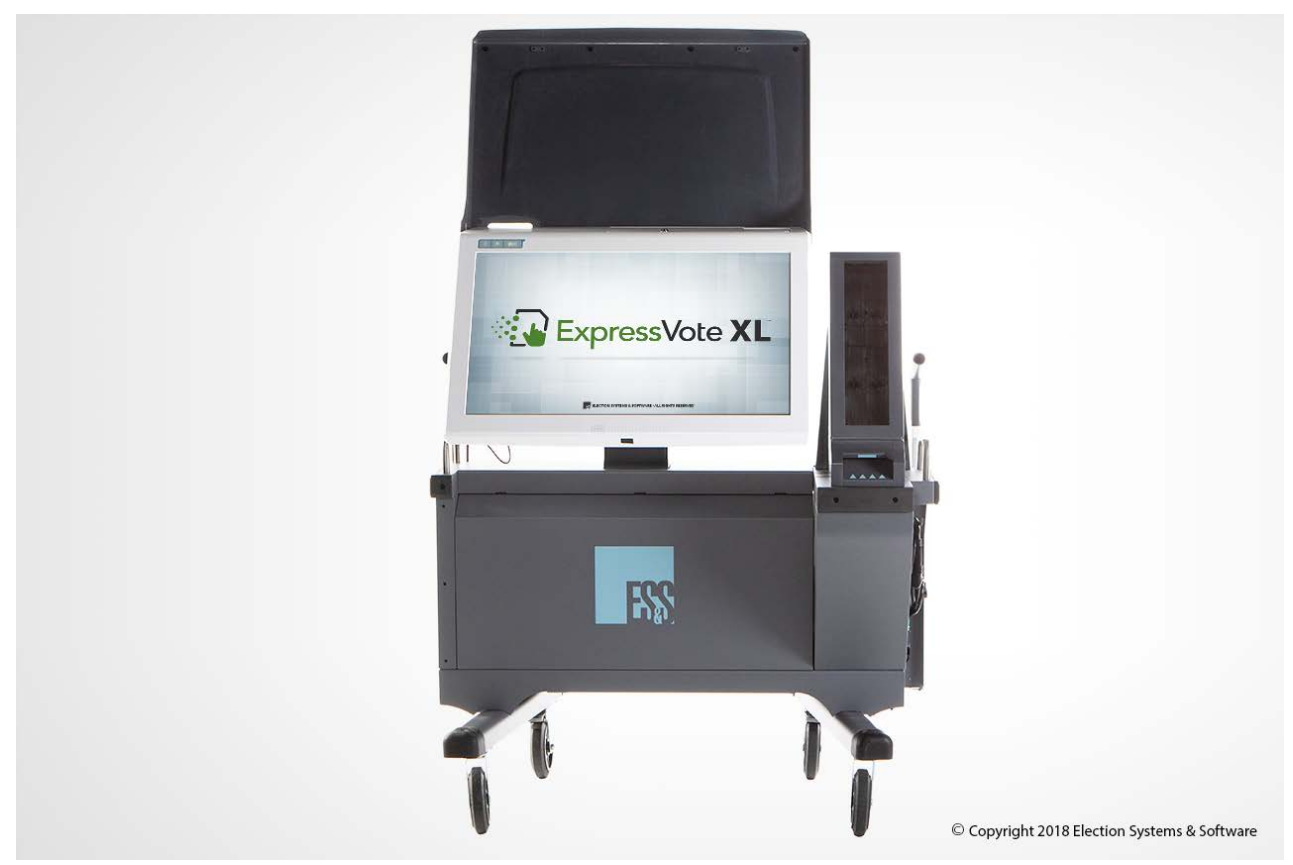
Fig. 1 ExpressVoteXL (Px 1012.)

The machine is reliable and easy to use. It is a hybrid device, combining ballot-marking and tabulating/scanning functionalities within a single system. (2/18/20 Tr. 105:1–6; 2/19/20 Tr. 186:22–187:6.) The voter first inserts a blank card into the slot to the right of the screen; this prompts the XL to load the appropriate ballot, which appears on the 32-inch touchscreen. (2/19/20 Tr. 186:25–187:6.) After she makes her selections, the machine prints them, producing a summary card: